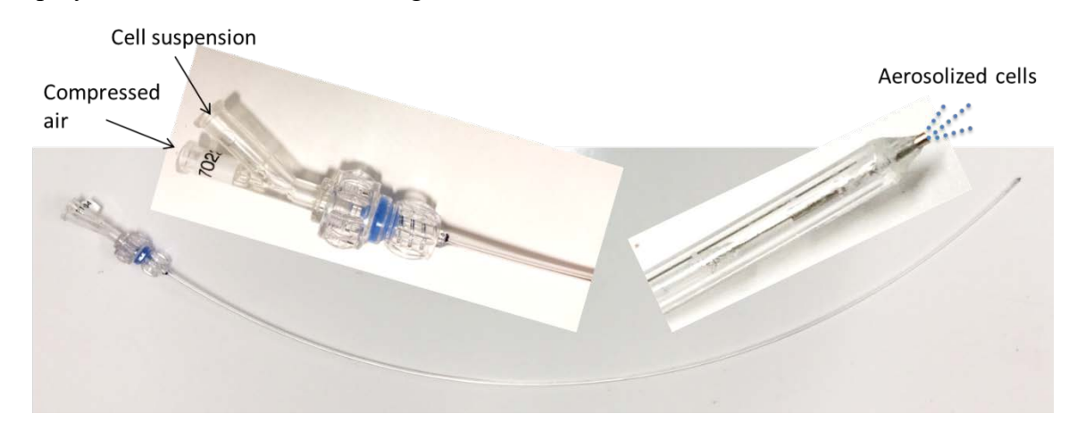
Figure 1: Microjet<sup>™</sup> Sprayer optimized for high cell viability and access in decellularized lungs

This project took place at the facilities of MSP Corporation (Shoreview, MN) and Mortari Lab (University of MN, Minneapolis). A novel spraying catheter has been developed for efficient stem cell delivery to the airways of decellularized lungs, see Figures 1. As shown in Figure 2, the original device, developed for intratracheal drug delivery, had a viability of about 50% (Group 1), which was improved in two steps to exceed 95%. This sprayer (referred to as Microjet<sup>TM</sup> Sprayer) is a critical component of the bioreactor system for regenerating a patient's lungs, starting with a lung scaffold created by decellularizing an animal lung comparable in size to the human lung. The regeneration process involves delivery of the patient's own stem cell-derived cells to the vasculature as well as airways of the lung scaffold. Whereas liquid-borne cell delivery is satisfactory for vasculature and small airways, a sprayer device has been needed for coating the walls of the large airways with viable cells, while maintaining lung function. In this project, we have not only developed a sprayer for coating the airway walls, we have also devised means to access the bronchi and other large airways via the trachea. Further, we have developed lighting means to locate the sprayer tip and built mechanical components to facilitate the use of the sprayer in a bioreactor, where lung scaffolds would be recellularized.